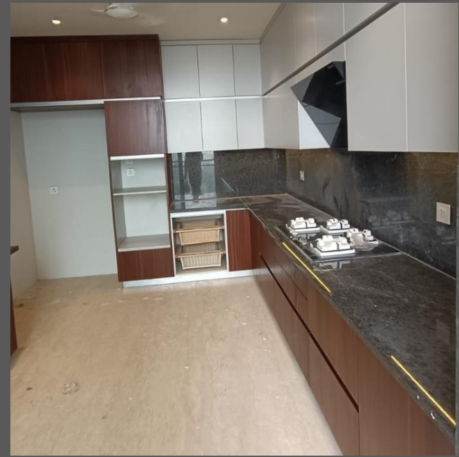
Platinum Towers (Gurugram) Delivered Kitchens wardrobes & Vanity For 280 Units