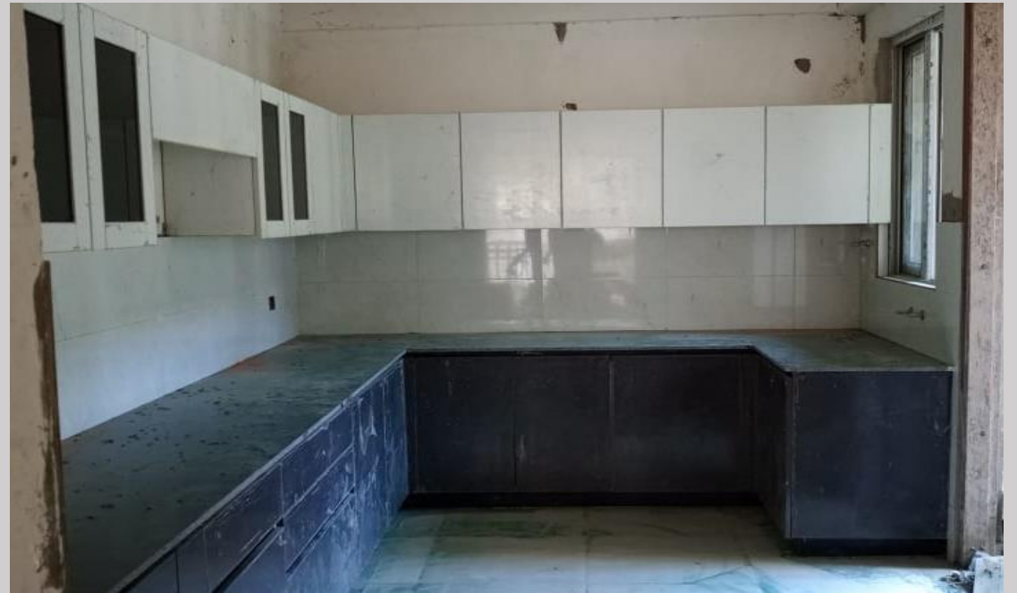
Eiffel Vivassa Estate (Lucknow) On Going Kitchens 90 Units