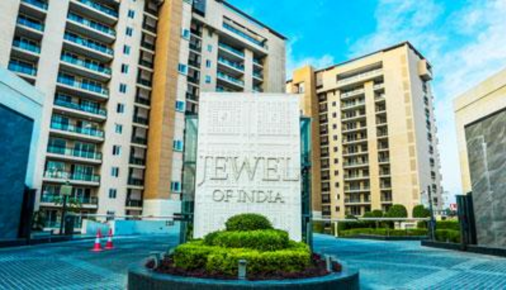
Jewel of India (Jaipur) On Going Kitchens wardrobes & Vanity For 450 Units