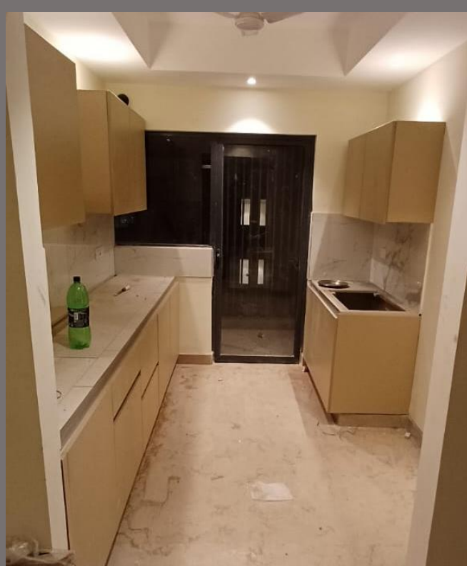
Suncity Vatsal Valley (Gurugram) Delivered Kitchens wardrobes & Vanity For 750 Units