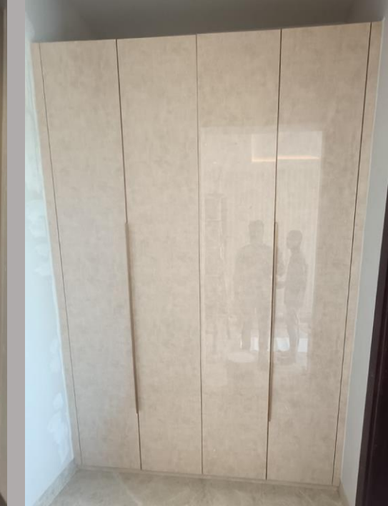
Samsara Homes By Jashn Realty (Lucknow) On Going Kitchens wardrobes & Vanity For 80 Villas